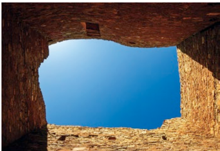
A skyward view inside ruins at Chaco Canyon National Monument.