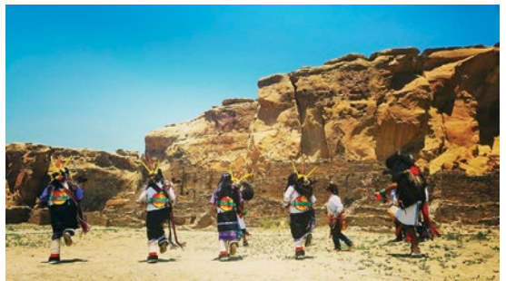
Acoma dancers at Chaco Canyon National Monument during a solstice ceremony.